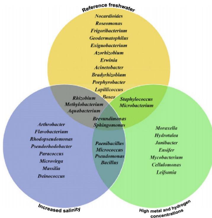
Fig. 2. Venn diagram showing the bacterial genera unique and/or shared between frog populations. The core bacterial genera included Brevundimonas and Sphingomonas strains common to the frogs in in all the studied environments, found as resilient organisms in the core microbiome of other frogs.

Salt impacted frog population exhibited, bacteria belonging to groups that were usually reported in salinized environments. Probably, strains from these bacterial genera will contribute to the ability of the frogs to colonize brackish waters in a greater or lesser extent, according to their own metabolic characteristics. The microbiome isolated from metal contaminated frog population, included strains from genera that also include pathogenic species to plants and animals, or linked to water and soil with poor quality. In the microbiome of reference frog population, were found strains from genera frequently related to freshwater systems (Fig. 2).