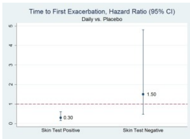
Fig. 1. Hazard Ratio of Time to First Exacerbation among participants treated with a daily inhaled corticosteroid as compared with placebo stratified by skin test result status.

Asthma is a common chronic condition caused by inflammation in the tubes that pass air in and out of the lungs. When asthma is poorly controlled, children cannot breathe normally, cannot play and exercise, and may have an attack bad enough to need emergency care. Fortunately, there are medications to treat asthma. Inhaled corticosteroids, when taken every day, reduce inflammation in the lungs and allow children with asthma to breathe and play normally with little risk of having an asthma attack. However, requiring a child to take a prescription medication every day is inconvenient, expensive, and may cause side effects. Our study set out to identify markers that predict which children with asthma might receive the most benefit from treatment with inhaled corticosteroids. This information could help parents and physicians make better treatment decisions.