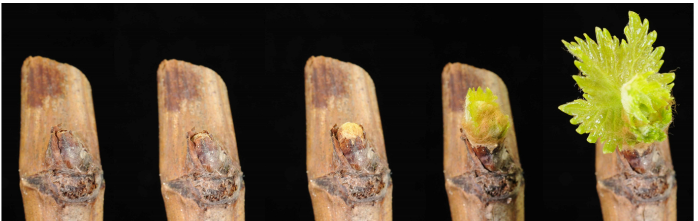
Fig. 1. Transition of dormant grapevine bud into shoot.

Grapevine is the most economically important fruit crop worldwide and is the mainstay of rural communities in over 100 countries. However, grapevine production is concentrated in latitudes of 30°-50°, and largely in maritime regions, due to its dependence on a seasonal, Temperate/Mediterranean climate. Growth beyond these climate regions is disorderly and requires intensive management, and hence often not commercially viable. Climate change and global warming is forecast to compress the viable growing zones and lead to increasing frequency of extreme weather events, with devastating impact on global productivity. The most climate-sensitive organ of the grapevine is the axillary bud, which undergoes an 18 month developmental cycle before buds burst, which drives the subsequent season's crop. Currently, there is very little understanding of how the bud senses and responds to climate signals, which is a key motivation for researchers at the University of Western Australia (UWA).