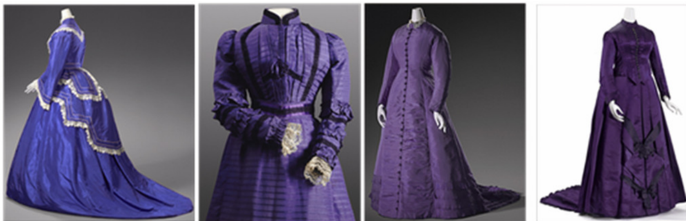
Fig. 1. Dress 1 circa 1865, dress 2 circa 1898, dress 3 circa 1878 and wedding gown circa 1885.

The identification of specific dyestuffs on textiles, especially when only small amounts of sample are available, is challenging due to a number of complexities including contamination and decomposition. In this work we investigated the purple coloration of three 19 th century English dresses and one Australian wedding gown using a combination of thin layer chromatography (TLC) and surface enhanced Raman spectroscopy (SERS).