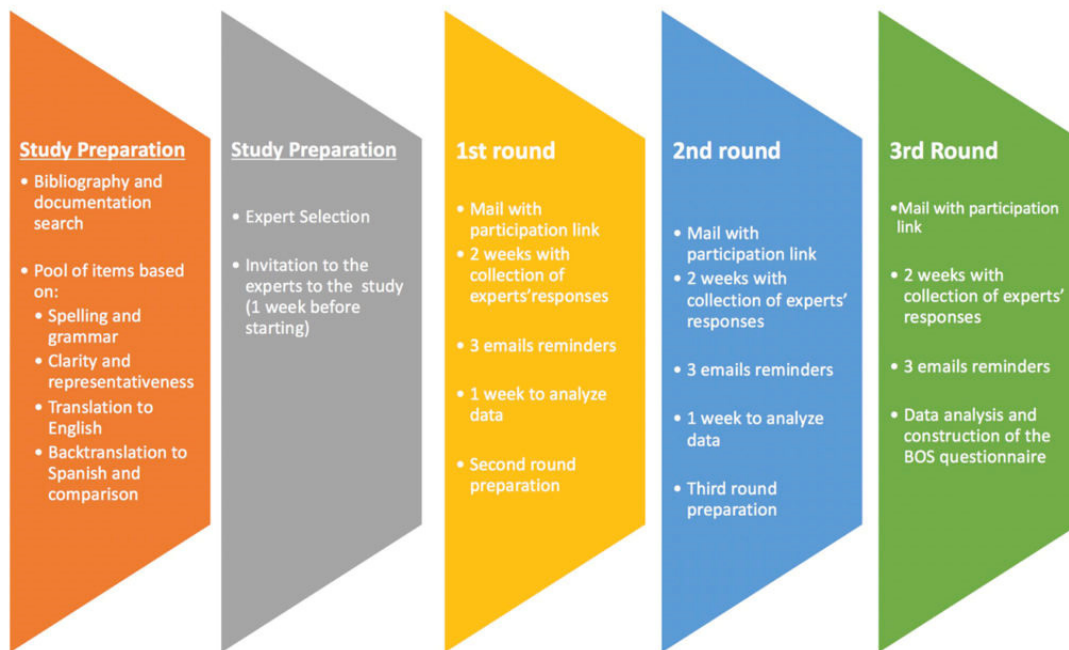
Fig. 2. Steps in preparing a Delphi study for the construction of the Barcelona Orthorexia Scale.

Our research aimed to develop, by consensus of experts, a questionnaire to evaluate some defining psychological features of orthorexia nervosa in English and Spanish language, the so-called BOS ( Barcelona Orthorexia Scale or Escala Barcelona de Ortorexia ). Initially, we created 105 items grouped into 6 different areas. To verify whether the contents of the items were representative of orthorexia nervosa and were easy to understand, we develop a 3-round Delphi study (Fig. 2).